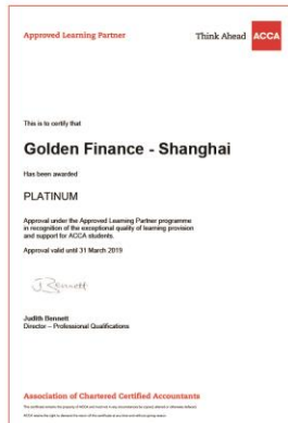
Platinum Approved Learning Partner Certificate